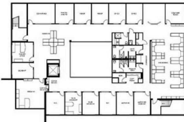
Second Floor Office